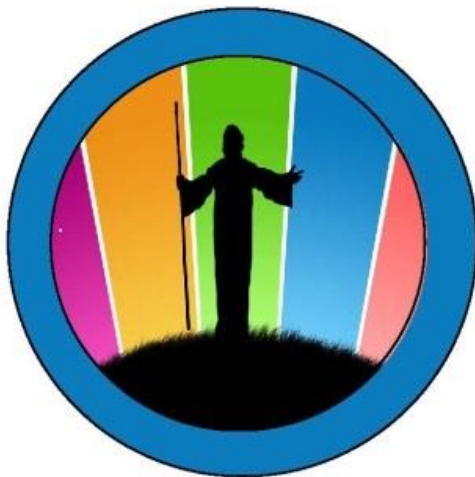
The Good Shepherd Multi Academy Trust